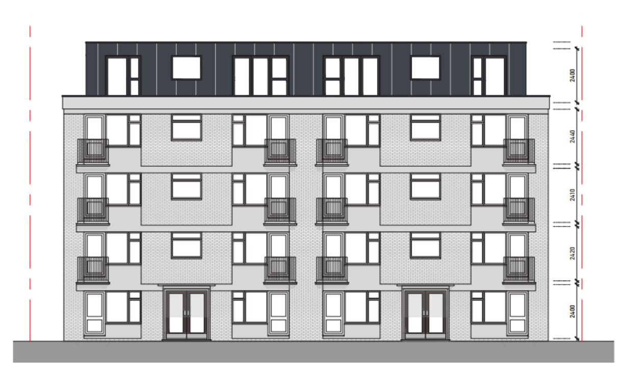
Figure 4: Proposed Front Elevation