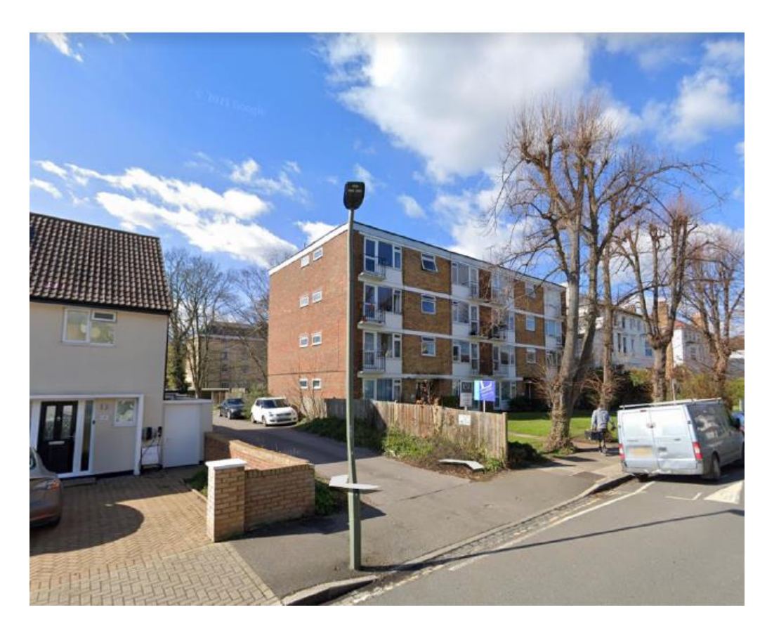
Figure 3: Existing Front Elevation