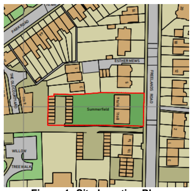
Figure 1: Site Location Plan